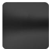
BLACK POWDER COATED